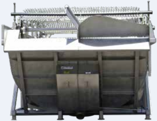
Drag Chiller Outlet End