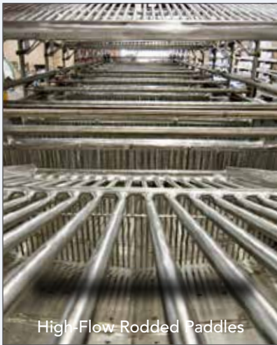
High-Flow Rodded Paddles